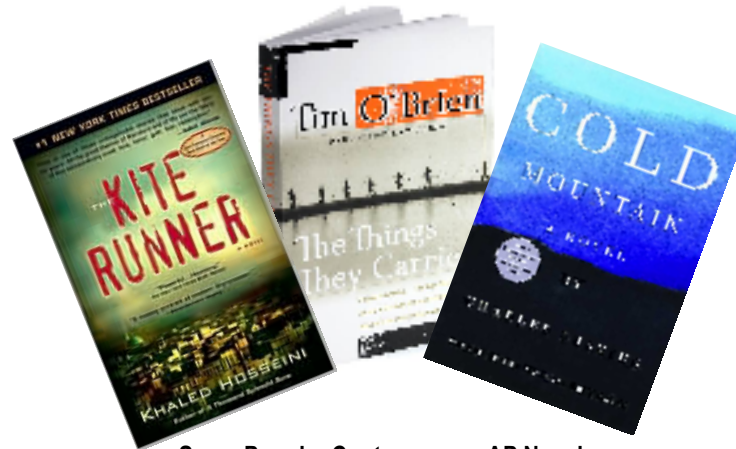
Some Popular Contemporary AP Novels